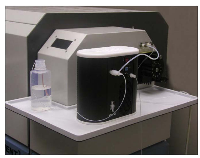
Greater work area makes using the Apex or other sample introduction systems more convenient.

Elemental Scientific Inc. 2440 Cuming St Omaha, NE 68131 USA www.elementalscientific.com